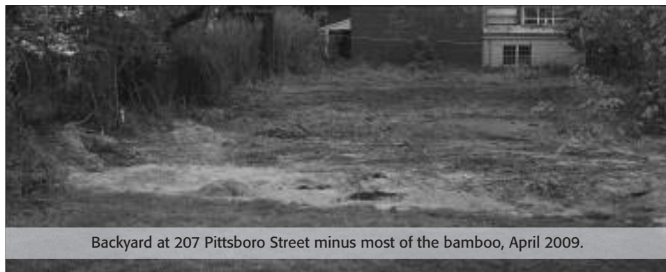
Backyard at 207 Pittsboro Street minus most of the bamboo, April 2009.